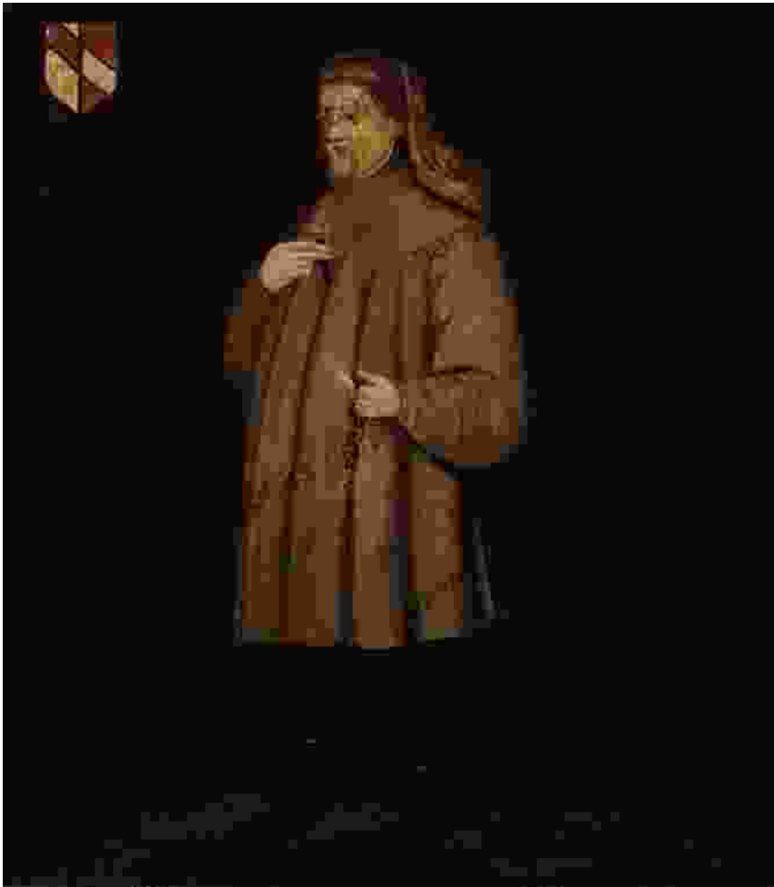
Geoffrey Chaucer, the father of English poetry

how critics of his time perceived his groundbreaking innovations and linguistic virtuosity.