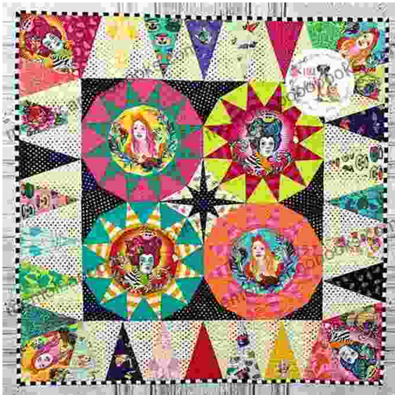
Image description: A stunning Tula Pink quilt in bold colors and patterns, showcasing her signature style.

shares her design process, providing readers with an exclusive glimpse into her creative mind. Discover the inspiration behind her unique patterns and learn how to incorporate Tula's signature style into your own quilting projects.