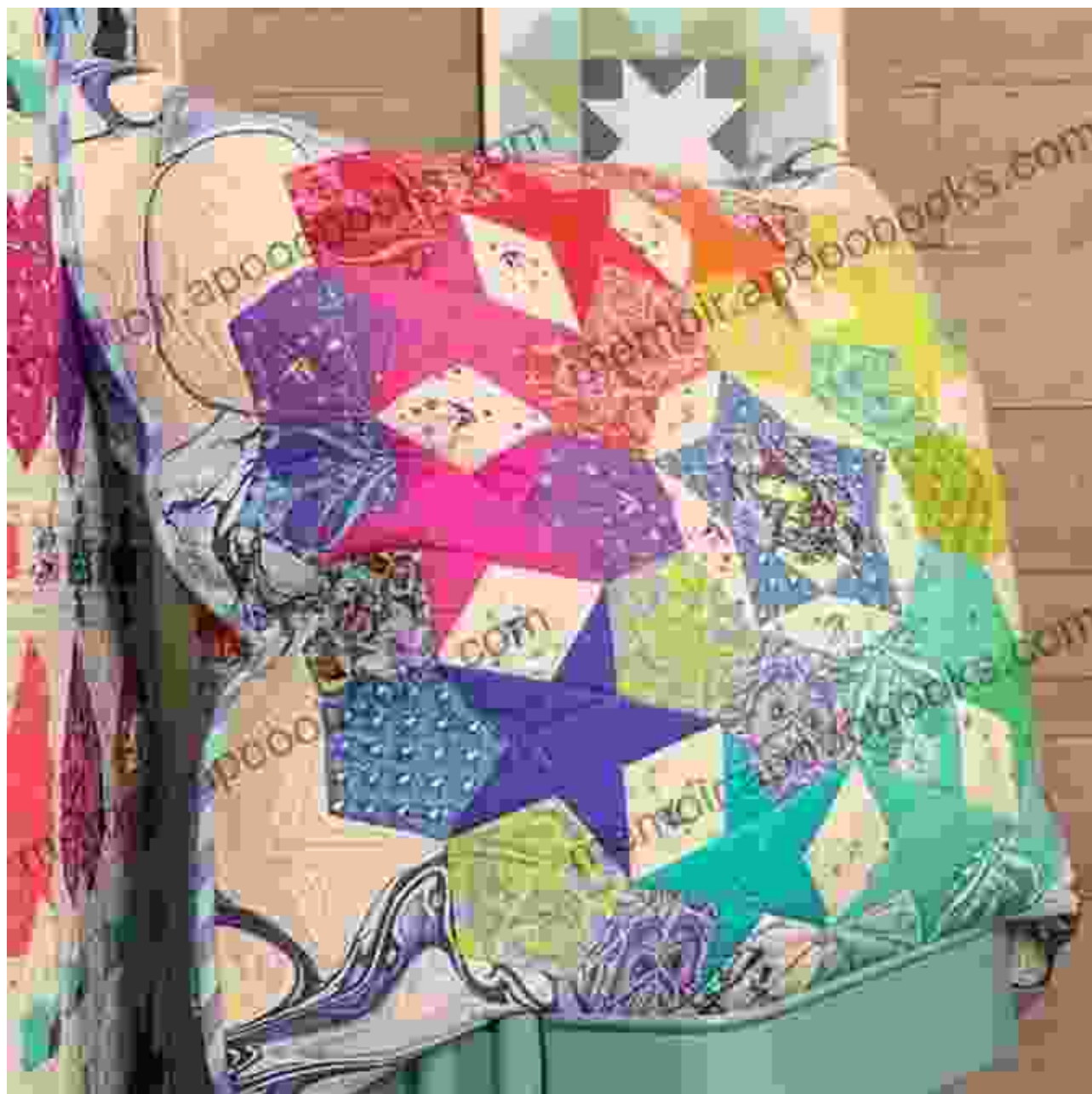
Image description: A detailed view of a Tula Pink quilt, demonstrating her mastery of modern quilting techniques.