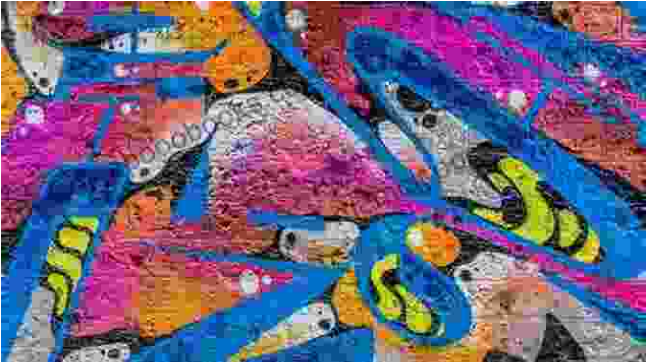
Image 2: The vibrant contrast between the decaying wall and the lively graffiti, highlighting the juxtaposition of beauty in unlikely places.