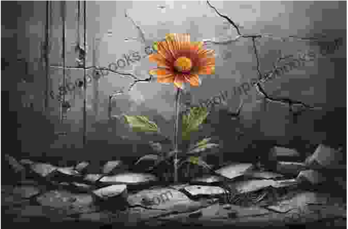
Image 4: The enduring power of beauty, represented by a fragile flower that thrives in an abandoned environment.